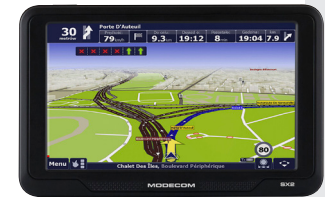
FreeWAY SX 7.3 IPS